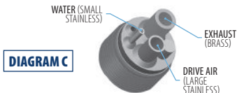
4 and 5 Hole