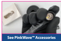
See PinkWave™ Accessories

Make sure your PinkWave™ is fully charged (base will pulsate pink during charging, and stay solid pink when charging is complete). See IFU for complete instructions.